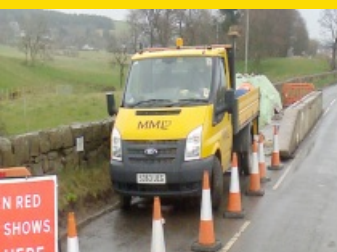
Road Structures Maintenance